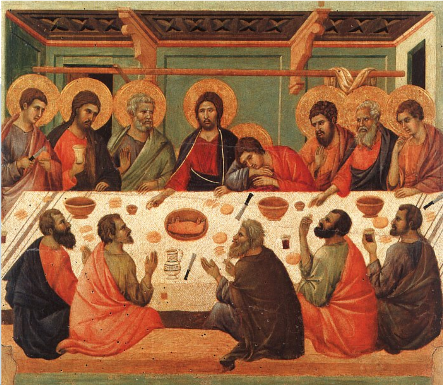
The Last Supper , Duccio di Buoninsegna, 1308-1311