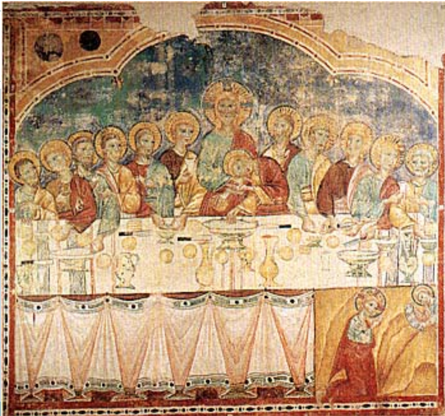
The Last Supper and the Agony in the Garden, about 1300