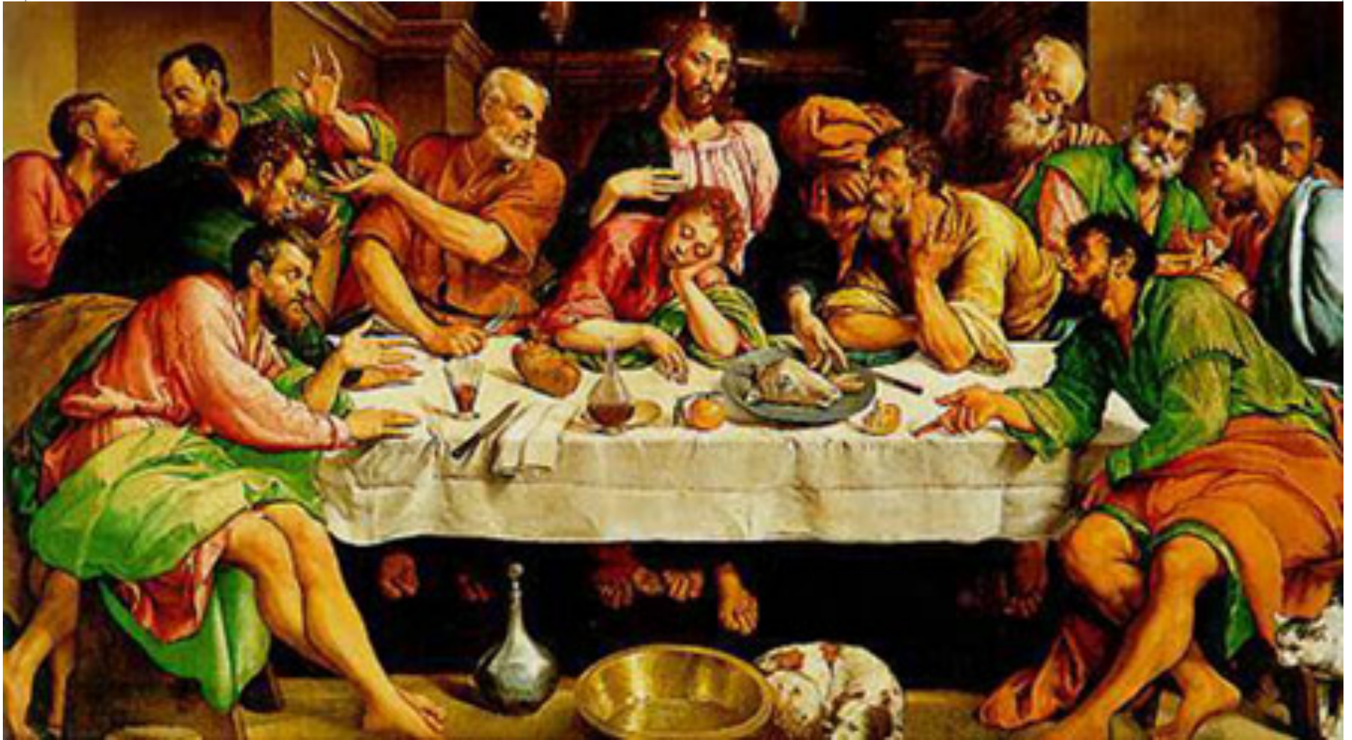
Last Supper (1542) oil on canvas cm. 30x51 | Jacopo Bassano