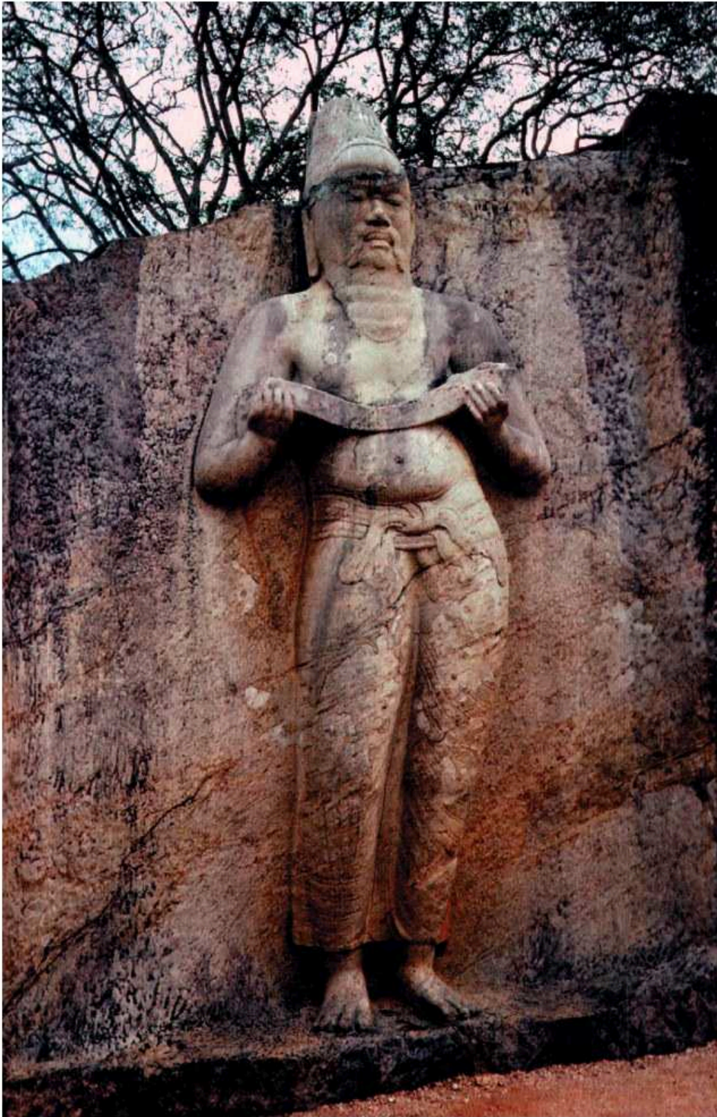
Ashoka of India Ways of the World, First Edition