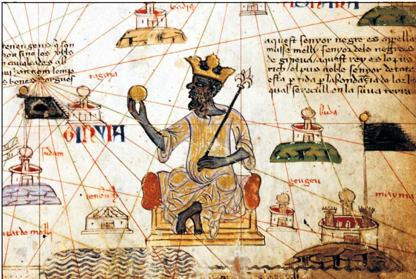
Map of Mali from the Voynich Manuscript Bibliothèque nationale de France