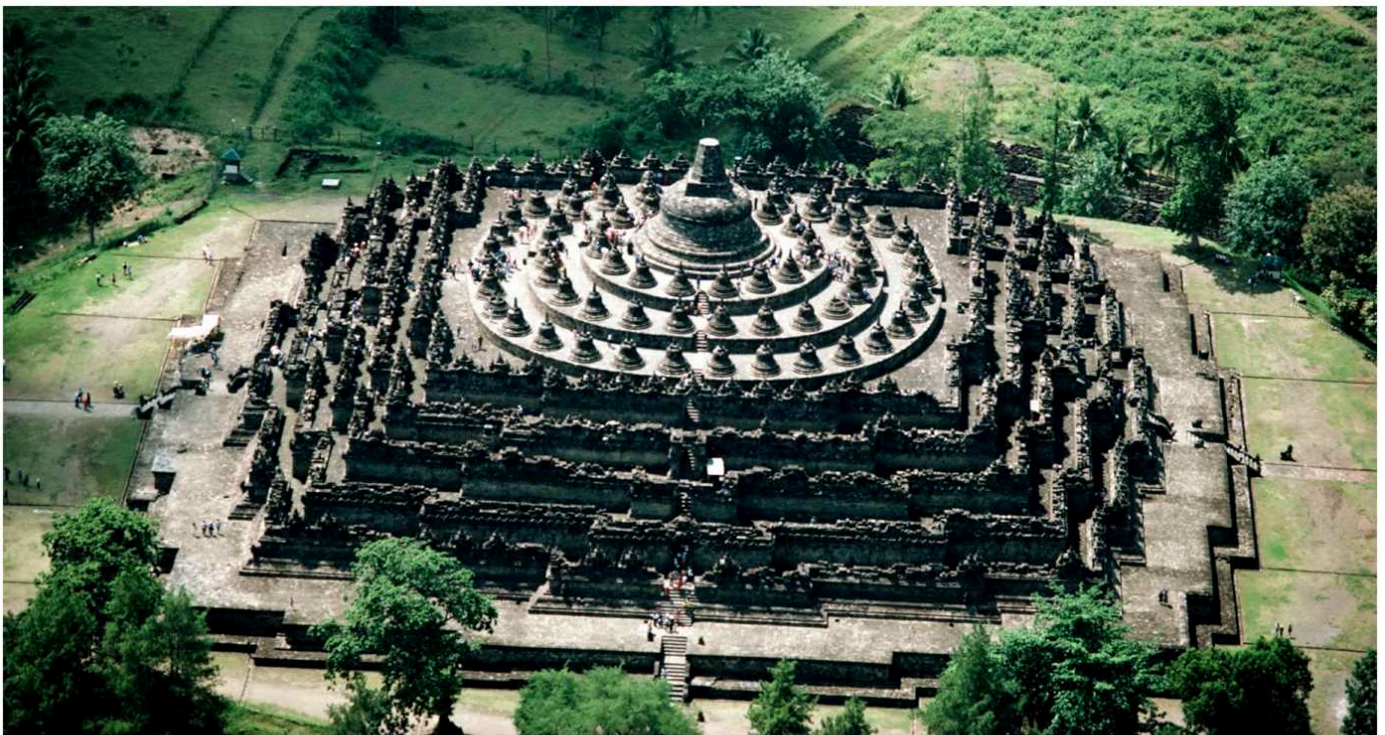
Borobudur Ways of the World, First Edition

Connect at least two images to the expanded trade networks of the Post-classical era.