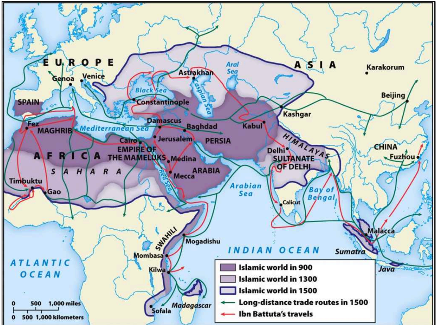
Map 11-2 Ways of the World, First Edition © 2009 Bedford/St.Martin's