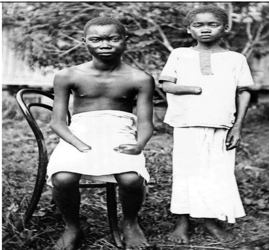
Colonial Violence in the Congo Ways of the World, First Edition