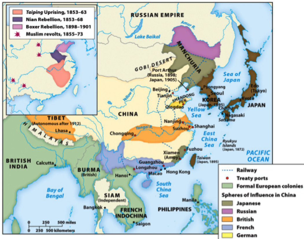
Map 19-1 Ways of the World, First Edition © 2009 Bedford/St. Martin's