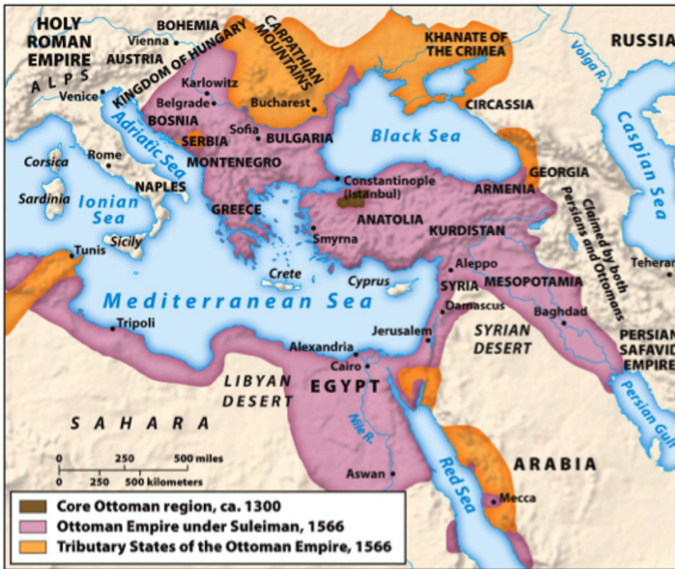
Map 14-3 Ways of the World, First Edition © 2009 Bedford/St. Martin's