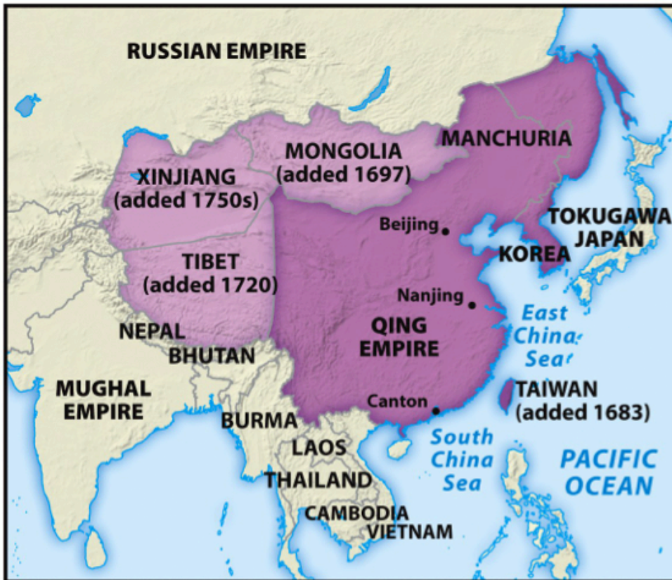
Spot Map 14-1 Ways of the World, First Edition © 2009 Bedford/St. Martin's