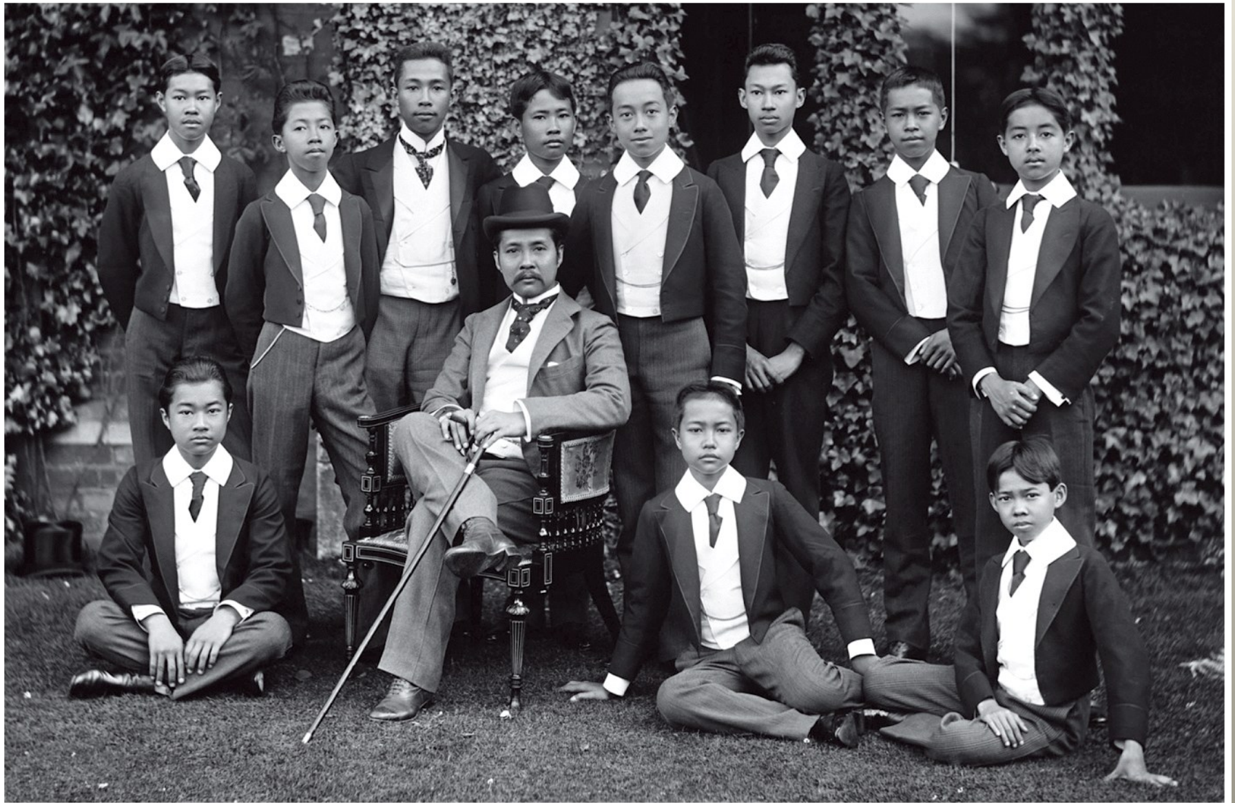
The Educated Elite Ways of the World, First Edition