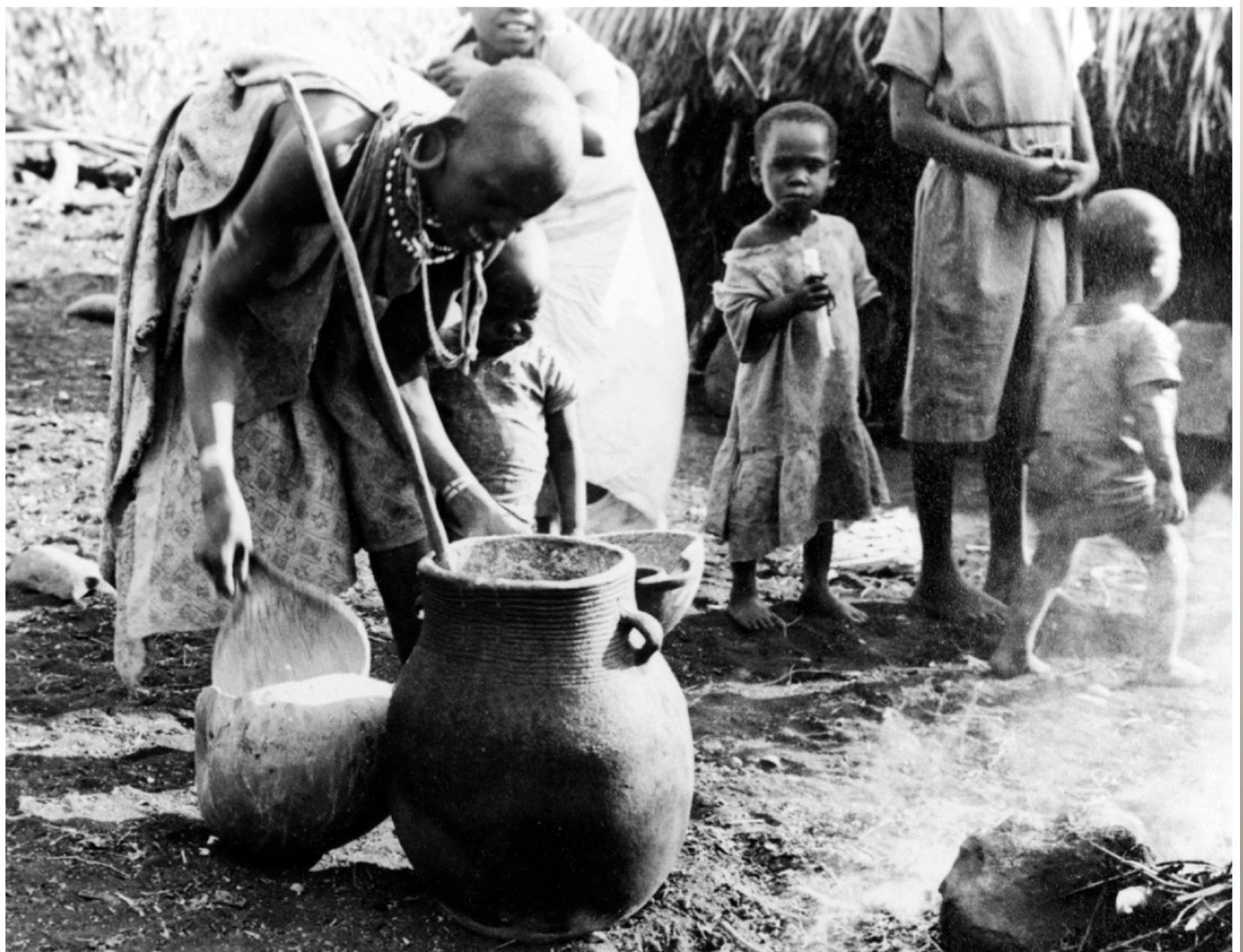
Women in Colonial Africa