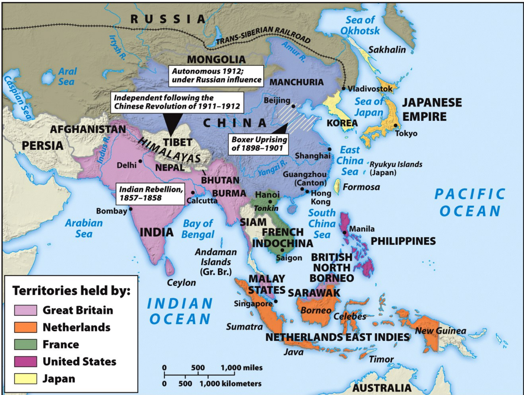
Map 20-1 Ways of the World, First Edition © 2009 Bedford/St.Martin's