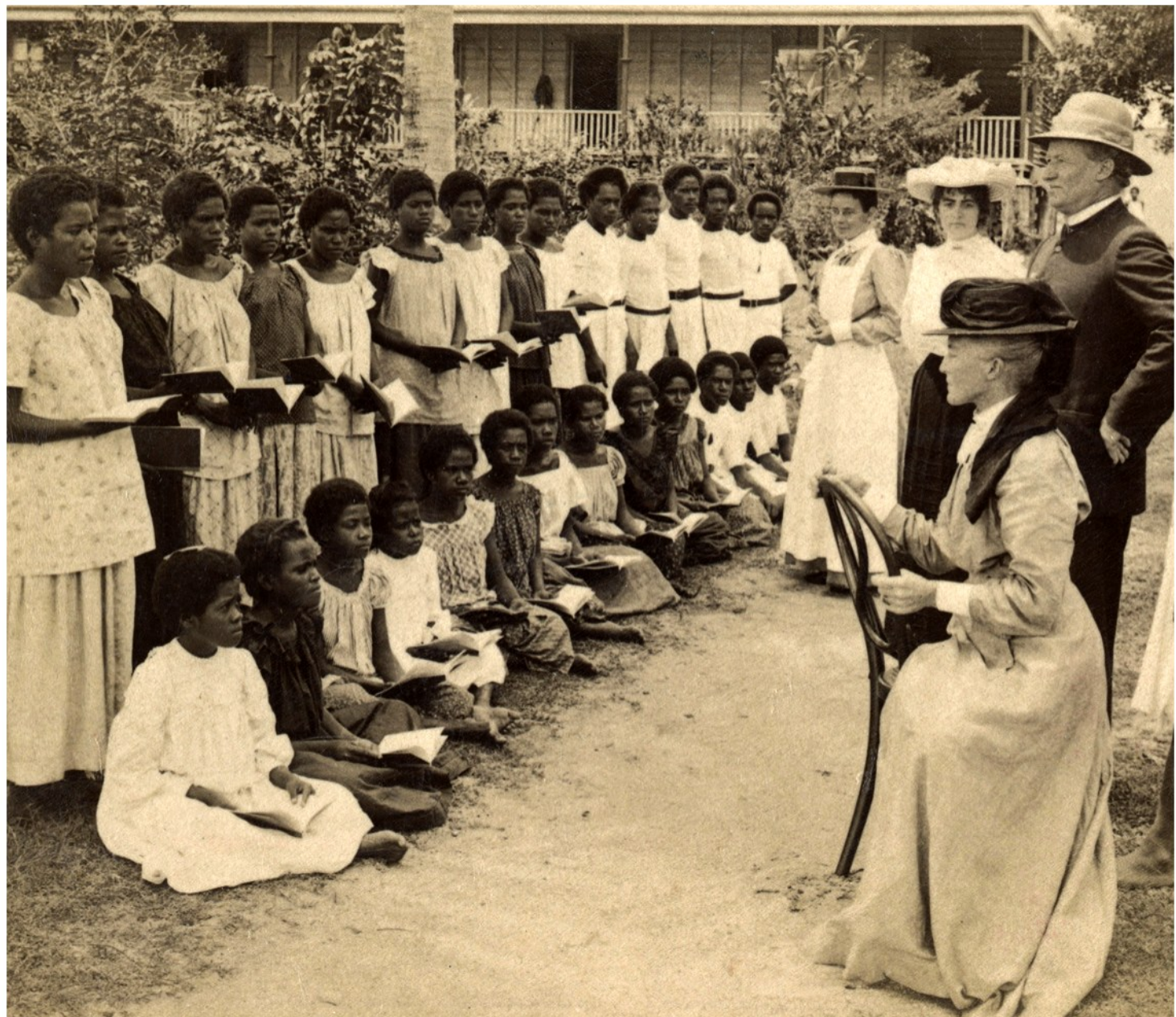
The Missionary Factor Ways of the World, First Edition