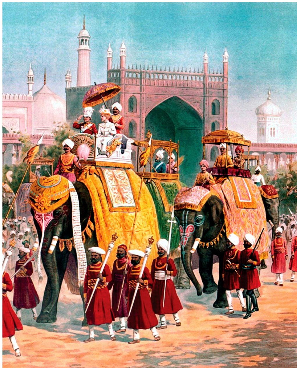
The Imperial Durbar of 1903 Ways of the World , First Edition