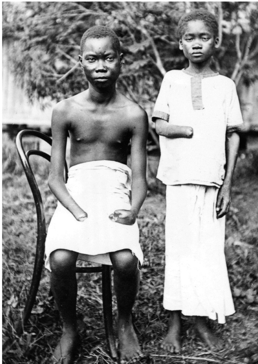
Colonial Violence in the Congo Ways of the World, First Edition