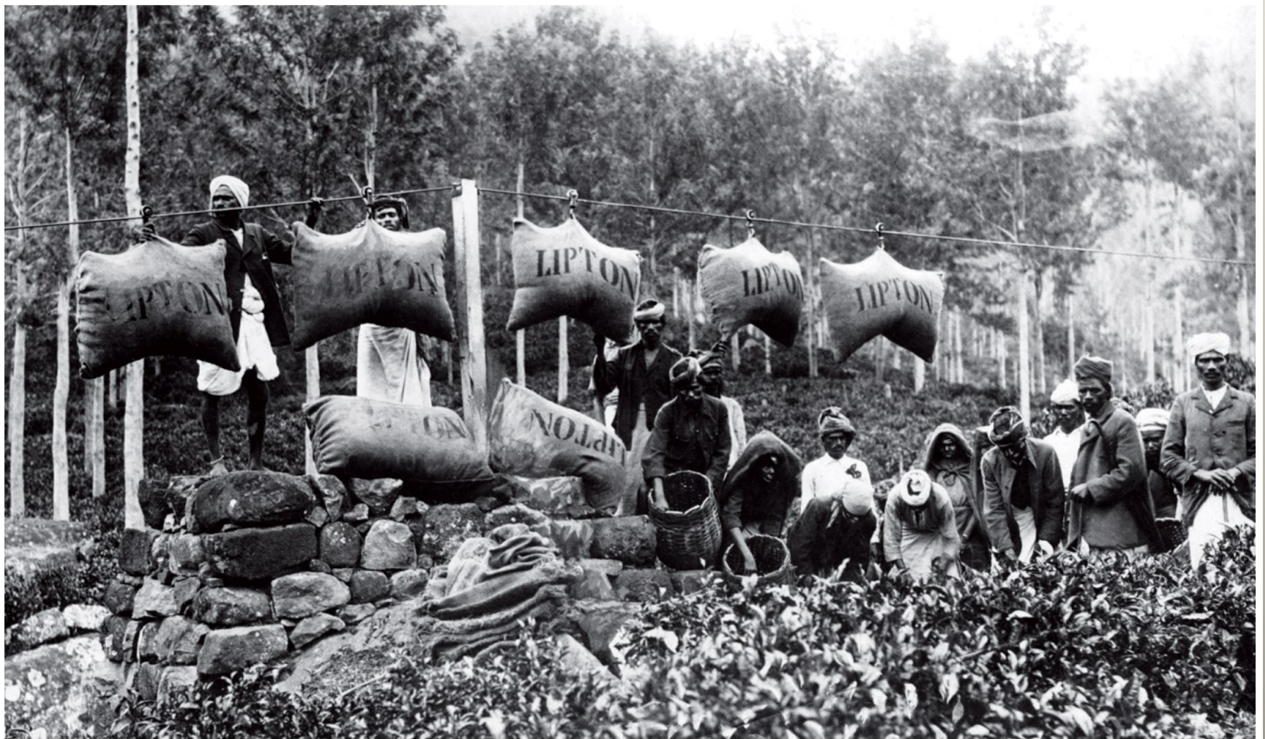
Economic Change in the Colonial World Ways of the World, First Edition