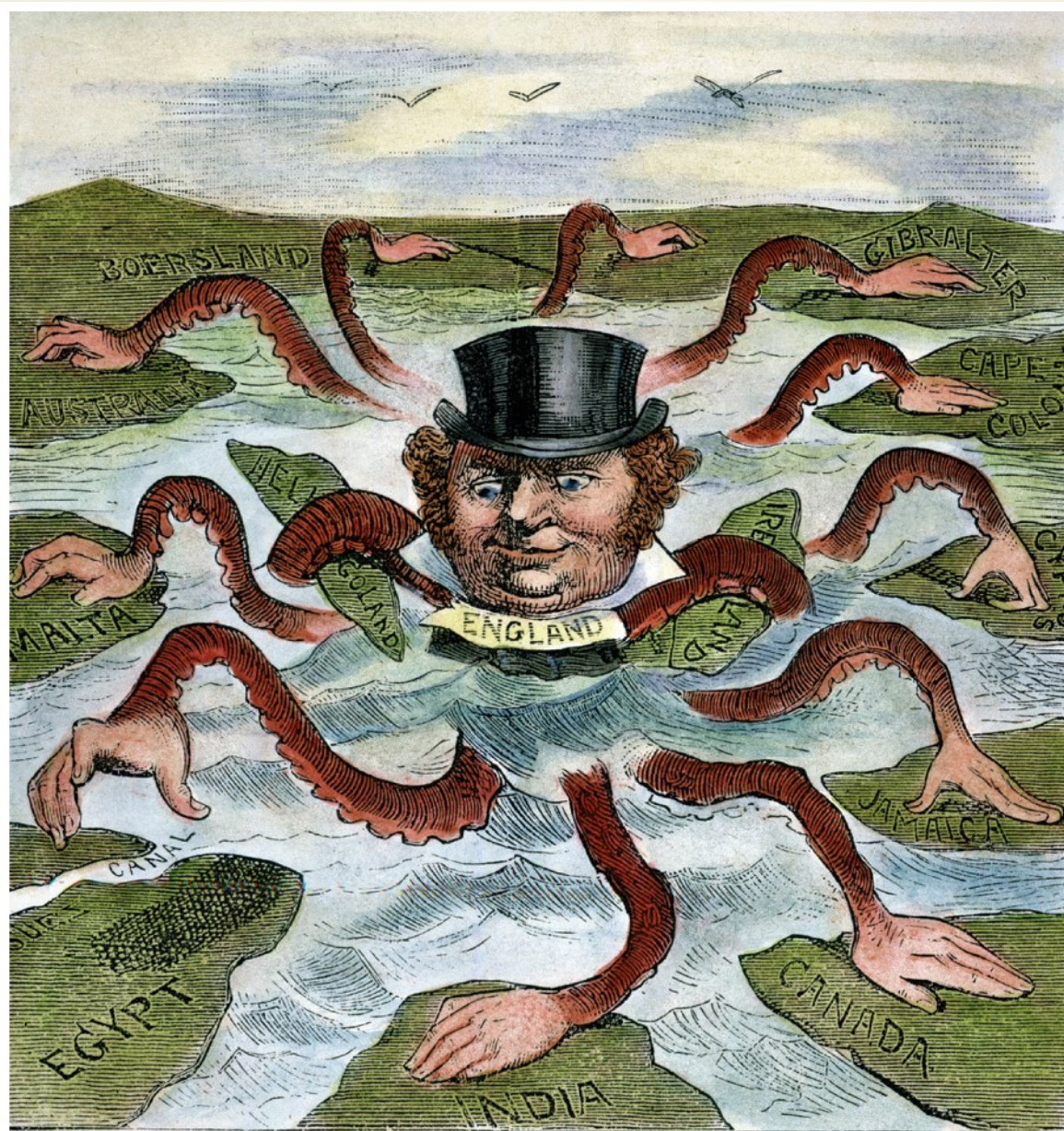
THE DEVILFISH IN EGYPTIAN WATERS.

An Egyptian View of British Imperialism Ways of the World , First Edition